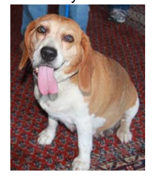
organization. You are very much